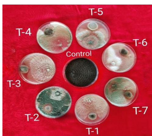
Plate 1. In vitro efficacy of bio control agents against growth of C. heterostrophus

The Bell's scale classified the antagonism nature of Trichoderma harzianum (KU904458), T. asperellum (KU933476), T. atroviride (KU933472), T. harzianum (KU933471), T. koningiopsis (KU904460), T. ovalisporum (KU904456) and Hypocrea lixii (KX0113223) to class II where the antagonist over grew at least two thirds of the pathogen surface.