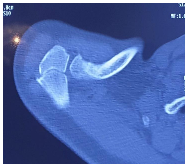
Fig. 3. Ct Scan showing OS Acromiale