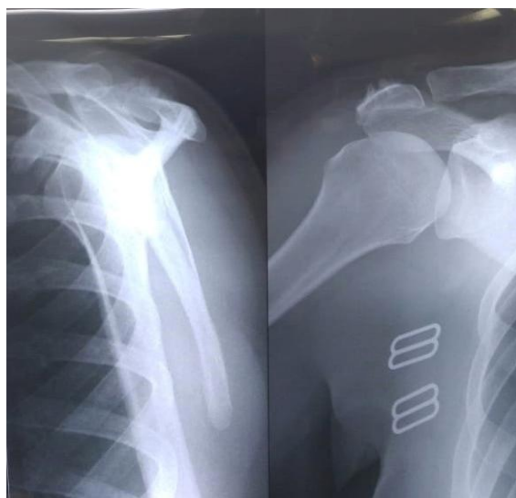
Fig. 1. X-ray showing Os acromiale and superior spur

Clinical examination revealed normal muscle bulk bilaterally. A bony hard projection was noted over superior aspect of the lateral border of the acromion. Digital pressure over the acromion was painful . Forward flexion and abduction of the shoulder was painful. Neer's and Hawkin's test for impingement were negative. Jobe's test for supraspinatus and Speed test for biceps were negative.