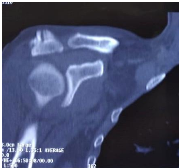
Fig. 2. Ct Scan showing superior spur

of conservative treatment, patient was advised surgical intervention. In beach chair position, using a lateral approach the left acromion was exposed. The bony spurs over the superior surface of the acromion were noted and excised using a saw and the surface smoothed with a burr (Figs. 4 and 5). The site of the os acromiale was examined, which showed minimal movement. Decision was taken not to excise the fragment due the risk of deltoid weakness. ORIF was not undertaken in view of minimal movement at pseudarthrosis site and no evidence of cuff pathology.