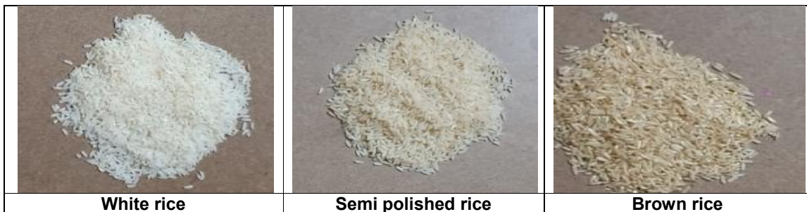
Plate 1. Types of primary processed rice

The farmers were growing 38 – 40 bags of paddy per acre, when processed as white rice 47 – 49 Kg were obtained that were Rs. 46 – 48 per Kg. Similarly, semi polished rice yielded 49 – 51 Kg at sold at Rs. 58 – 60 and brown rice yielded 53 – 54 Kg sold at Rs. 65 per Kg. These costs of selling each of these mentioned varieties have been analysed and tabulated. Plate 1 displays the white, semi polished and brown rice below.