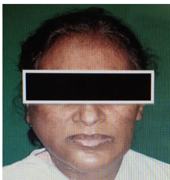
Fig. 2. Postoperatively