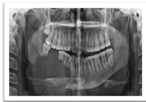
Fig. 4. Preoperative (Radiological)