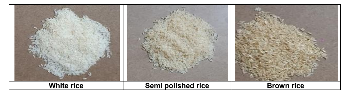
Plate 1. Types of primary processed rice

The farmers were growing 38 - 40 bags of paddy per acre, when processed as white rice 47 - 49Kg were obtained that were Rs. 46 - 48 per Kg. Similarly, semi polished rice yielded 49 - 51 Kg at sold at Rs. 58 - 60 and brown rice yielded 53- 54 Kg sold at Rs. 65 per Kg. These costs of selling each of these mentioned varieties have been analysed and tabulated. Plate 1 displays the white, semi polished and brown rice below.