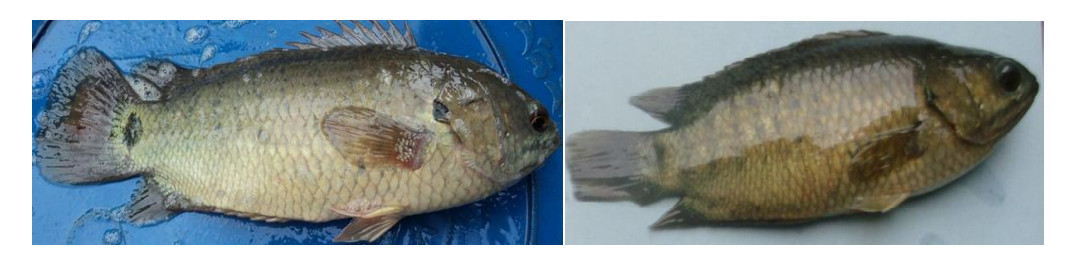
Fig. 2. Vietnamese koi and Thai koi at the end of the experiment