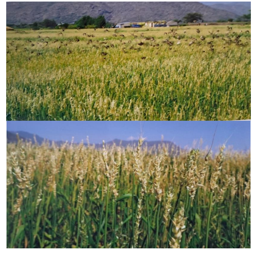
Fig. 2. Incidence and severity of Quelea quelea birds on the crop field