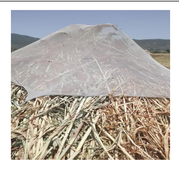
Fig. 4. Farmers covering harvested crops with plastic and nets