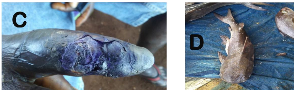
Fig. 2. Gangrene of the right index finger (C) in a 45-year-old fisherman, caused by a bite from a stingray (D) in an artisanal fishing port in Conakry