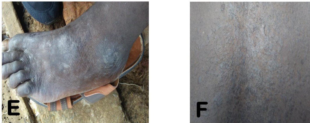
Fig. 3. Lichenic eczema of the left foot in contact with boots in a 45-year-old fisherman (E) and pityriasis versicolor on the back in a 40-year-old fisherman in permanent contact with mud (F) in the artisanal fishing ports of Conakry