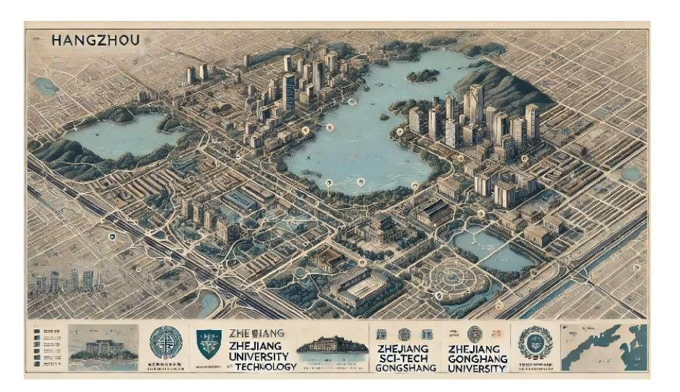
Fig. 2 Map of Universities in Zhejiang Province

Dai and Shengyu; S. Asian J. Soc. Stud. Econ., vol. 21, no. 8, pp. 64-80, 2024; Article no.SAJSSE 120185